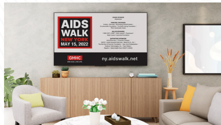
AIDS Walk New York PSA video