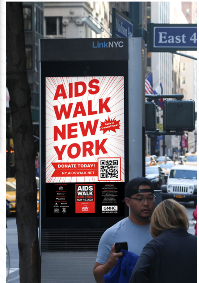
AIDS Walk New York LinkNYC outdoor digital ad