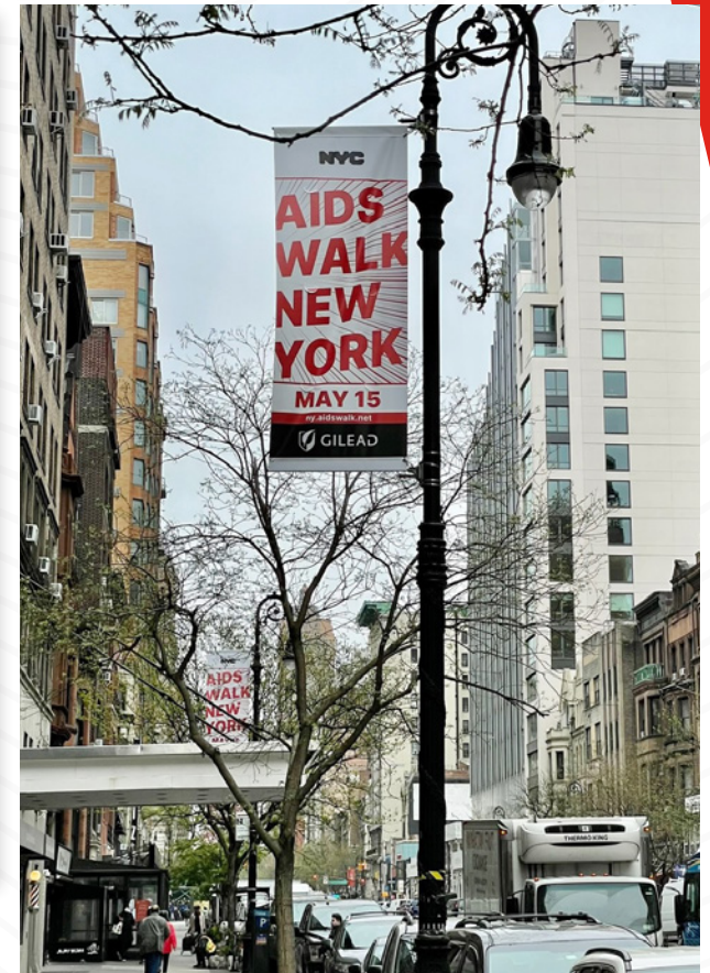
AIDS Walk New York Street banner