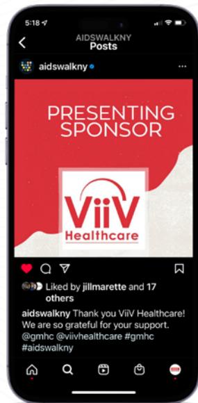
AIDS Walk New York social media thank you posts