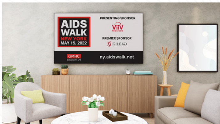
AIDS Walk New York PSA video