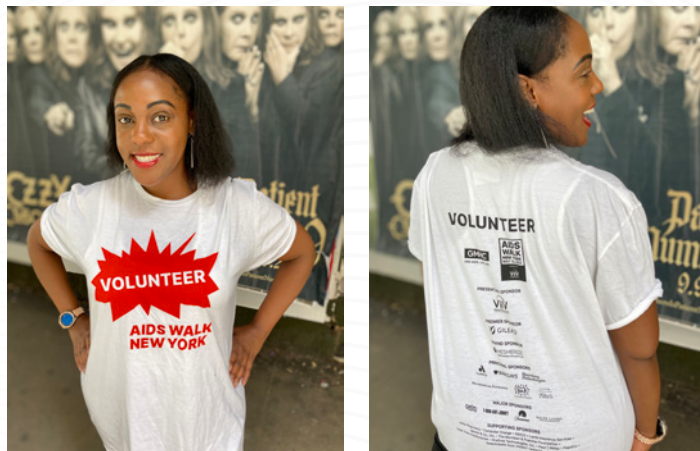
AIDS Walk New York volunteer t-shirt