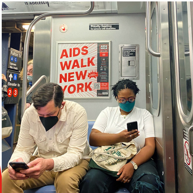
AIDS Walk New York poster

Your partnership will be highlighted within the AIDS Walk's extensive promotional campaign, which reaches every medium and conveys the event's power, energy, and sense of community.